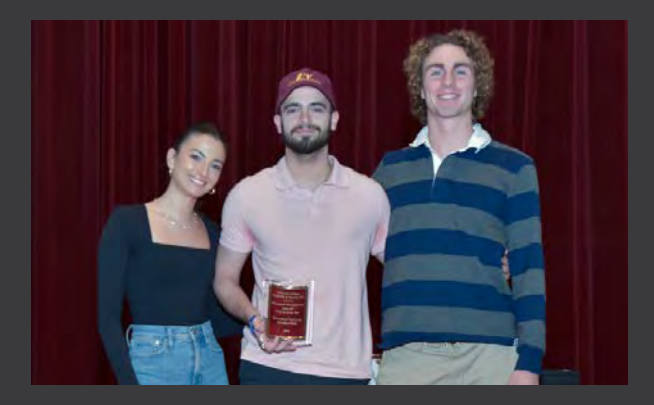
3RD ANNUAL NEIL LEVIN 9/11 STAIR CLIMB ZETA PSI