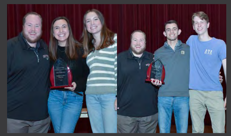
DELTA TAU DELTA & ALPHA GAMMA DELTA