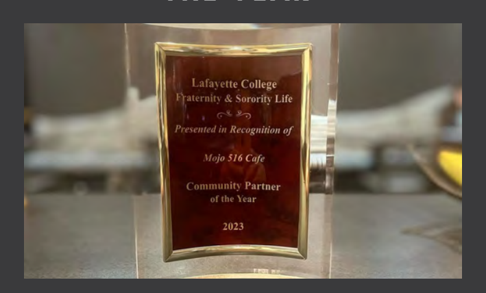
MOJO 516 CAFE