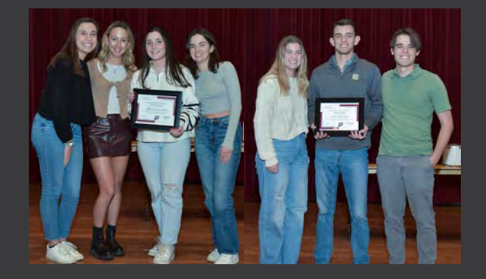
ALPHA GAMMA DELTA & DELTA DELTA