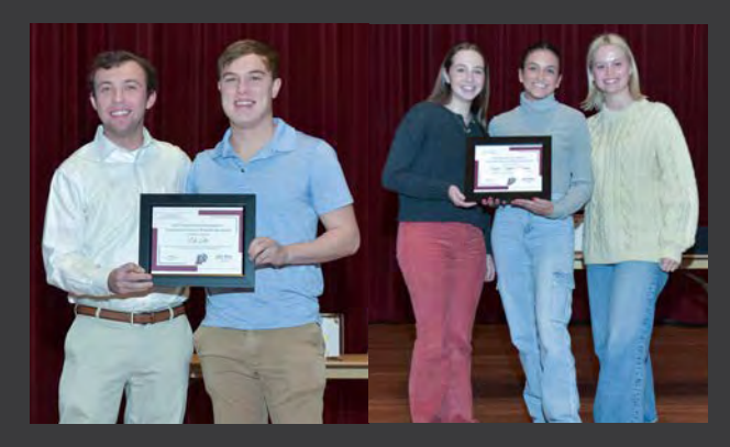
CHI PHI & KAPPA KAPPA GAMMA