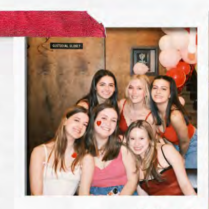
χοχο, alpha phi

During Heart Healthy Week, our chapter raised about $1,700 for the Alpha Phi Foundation. The Alpha Phi Foundation funds research and educational programs that support the advancement of women's heart health through a better understanding of women's heart disease, the number one leading cause of death in women. The proceeds we raised through various events hosted during this week, including Cupcakes and Compliments, Heartbeat Hunt, and Galentine's Paint n' Sip, were donated to the Alpha Phi Foundation to support our philanthropy.