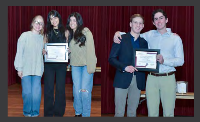
ALPHA PHI & DELTA UPSILON